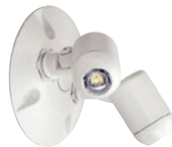
EVO Outdoor LED Remote LED Outdoor Single or Double Head Remote Black or White Finish Powered by EV4 Light or EVCD4 Combo Die-Cast Aluminum heads and universal mounting plate