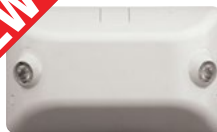
EVR Indoor LED Remote LED Double Head Remote Black or White Finish Powered by EV4 Light or EVCD4 Combo