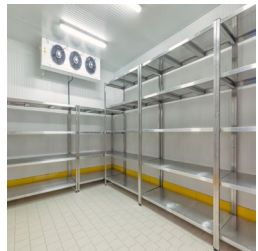
Cafeterias / Kitchens