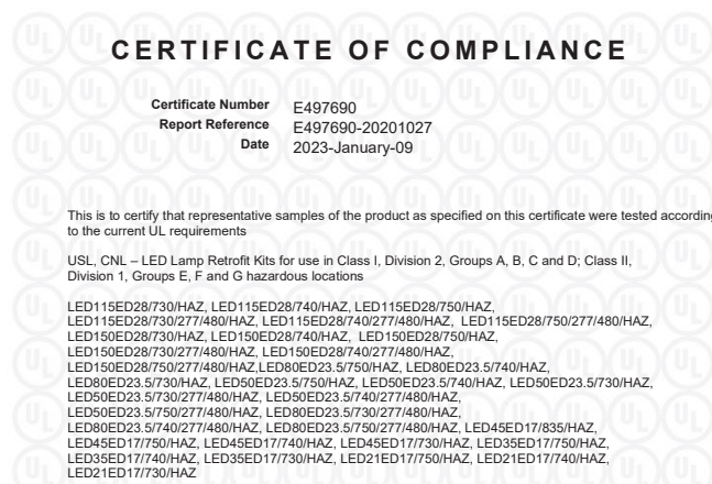
Figure-4: An example of a portion of a UL Certificate of Compliance

Manufacturers of Light-emitting-diode Retrofit Luminaire Conversion Kits for Use in Hazardous Locations should also be able to provide a UL Certificate of Compliance to UL 844 upon request.