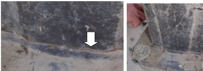
Figure 12: Example of fatigue cracking at the base plate weld