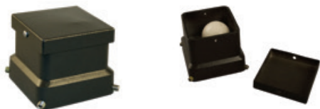
Figure 10: First Mode Vibration Damper (Q41)

Hubbell offers a First Mode vibration damper (Q41) that is factory assembled, painted to match, and ready for field install. It is designed for 4", 5", and 6" square aluminum and steel lighting poles.