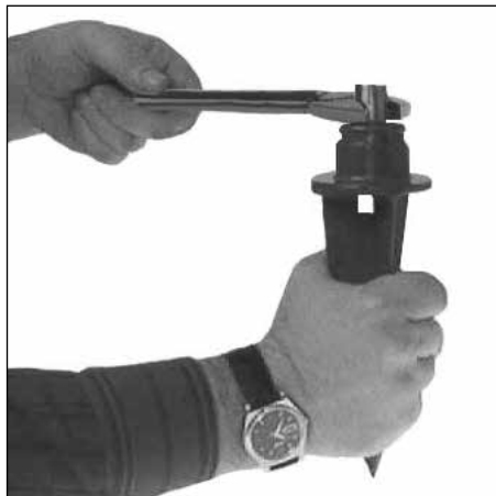
1. Tighten coupling onto mounting device*.

WARNING: Make certain the electrical supply is OFF before starting fixture installation.