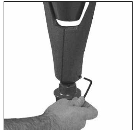
3. Loosen setscrew, adjust fixture rotation, and tighten setscrew.

IMPORTANT: Do not overload the transformer by installing higher wattage lamps than planned. Remember, the total wattage of all lamps connected to one transformer must not exceed the capacity of that transformer.