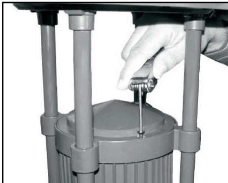
2. Remove ballast cover from fixture using hex wrench.