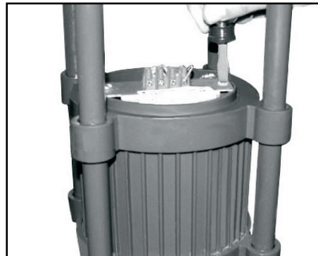
3. Remove the two screws holding the ballast plate in place and slide ballast out.