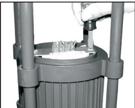
6. Reinstall ballast by securing with the two screws.