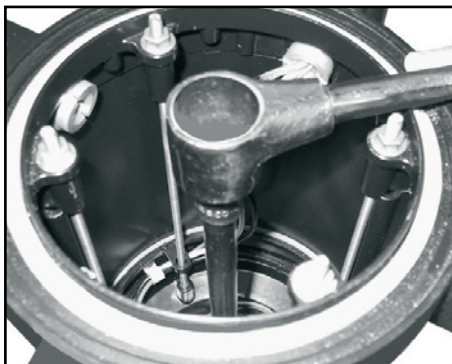
5. Tighten securely using 1/16" socket, 12" extension and ratchet.