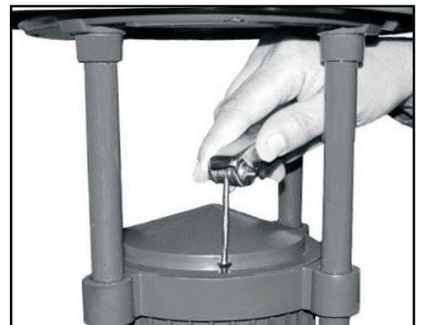
7. Install ballast cover with the two screws provided.