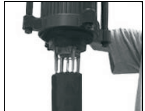
4. Install fixture assembly to pole. Orient fixture relative to mount to provide desired lighting distribution.