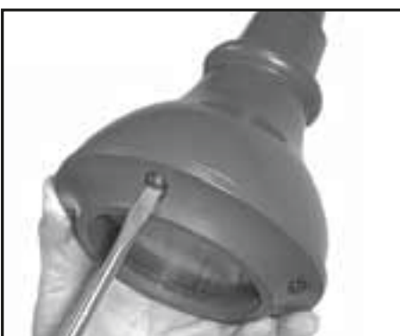
5. Remove screws from lens frame with a flat blade screwdriver.