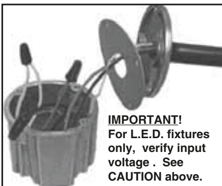
4. Make all necessary connections observing polarity, i.e. green-to-ground, white-to-common, and black-to-voltage.