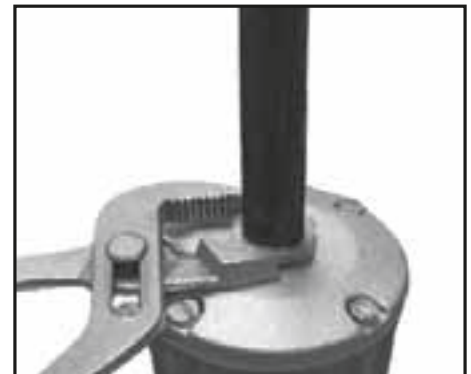
3. Position fixture & tighten locknut with adjustable wrench.