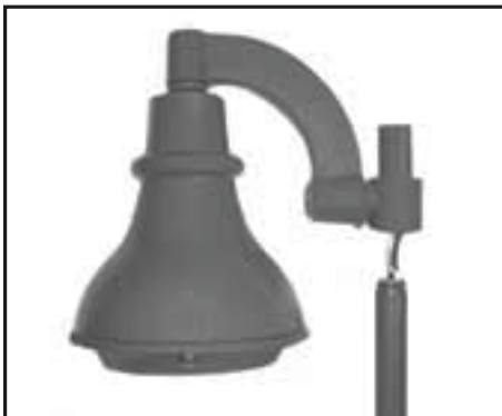
1. Run wires through pole and thread short thread into pole cap.

Installation Instructions: Make certain the electrical supply is OFF before starting fixture installation.