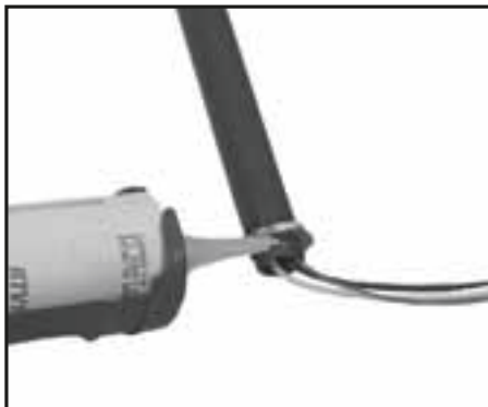
2. Coat threads with a good sealant and install pole into desired junction box. (Direct burial box for H.I.D.)