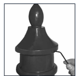
Install pole spacer onto top of pole. Attach finial to pole spacer.