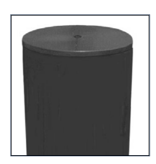
1. Attach dome or flat pole cap to pole.