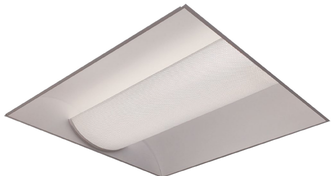
Image represents correct installation of overlay material.

If overlay can be seen protruding from basket it is installed incorrectly.