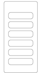
6 Button w/ no Light Pipe