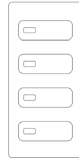
1-4 Button w/ Light Pipe