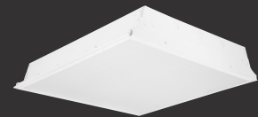
Columbia LJT Light Commercial LED Full Distribution Troffer