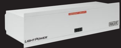
RECESSED CEILING T-GRID