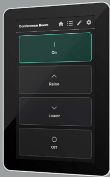
Switch-Based User Interface