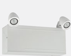
LM Series (12V)