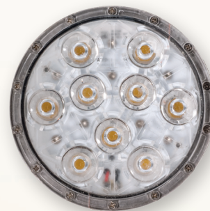
LED Light Engine