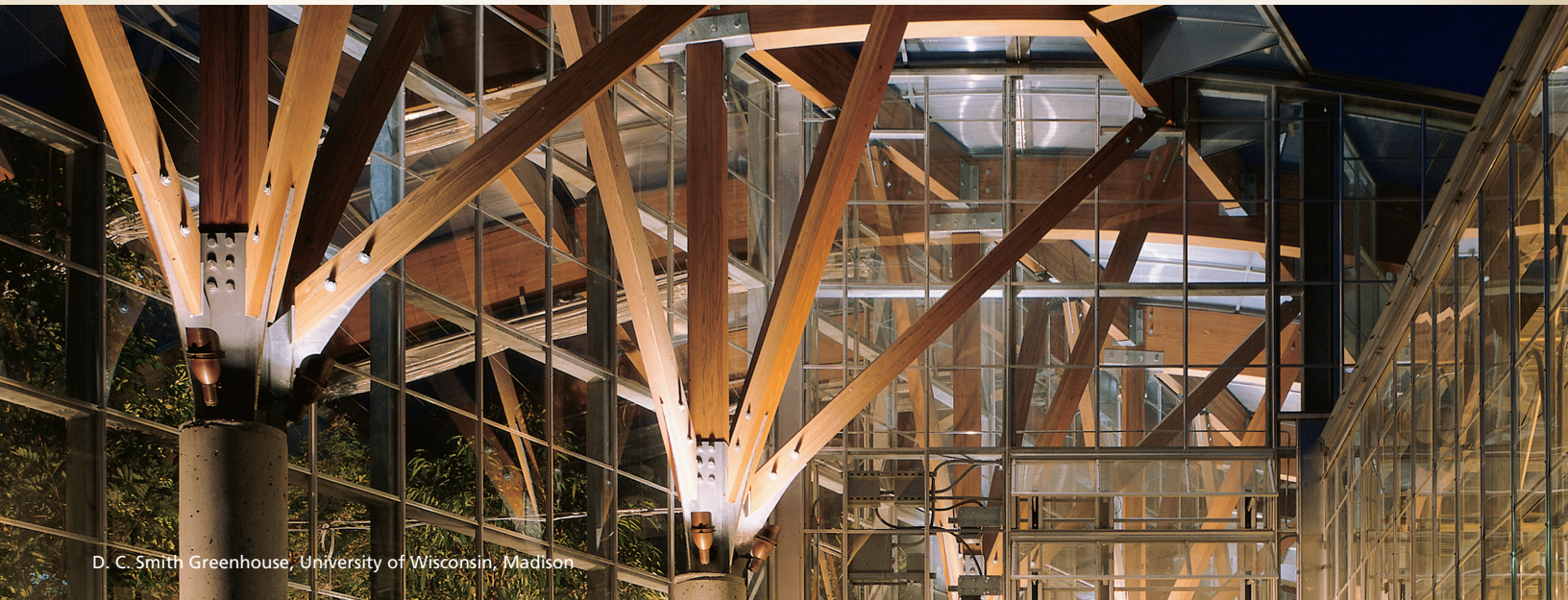
D. C. Smith Greenhouse, University of Wisconsin, Madison

High lumen output LED performance and timeless corrosion resistant copper and brass sets the C24 Luminaire apart from ordinary accent lighting. The brass and copper luminaire ages to a fine patina blending into its surrounding and carries an unmatched 25 year warranty.