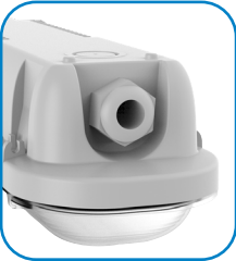
Conduit Hub Shown *two conduit hubs are provided with each fixture for use during fixture installation