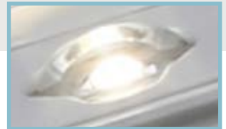
With patented french door lens