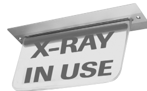
Special Wording Option

NOTE: Special worded signs do not meet letter size requirements of UL 924.