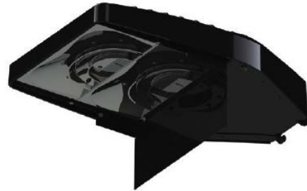
Double Module Back Shield