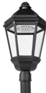
Towne Commons ALN440